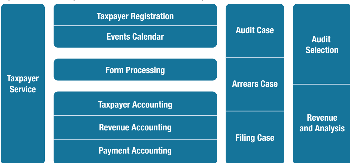
Figure 1. Functionality Needed in a Tax Administration IT System

But all tax systems are different... This is an often-heard statement. But in essence, all tax systems are the same—they need to identify taxpayers, process information so they know who owes money to whom and collect tax. Typical functionality in core tax administration IT systems is demonstrated in Figure 1: Functionality needed in a tax administration IT system.